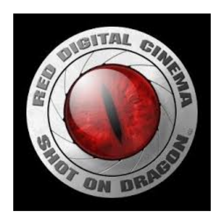
Shot on Red Dragon and DJI Phantom 3 Professional