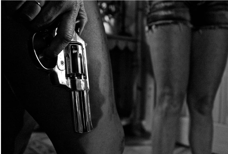
On set photo just before "Avery" puts a gun to "Gwyn's" head