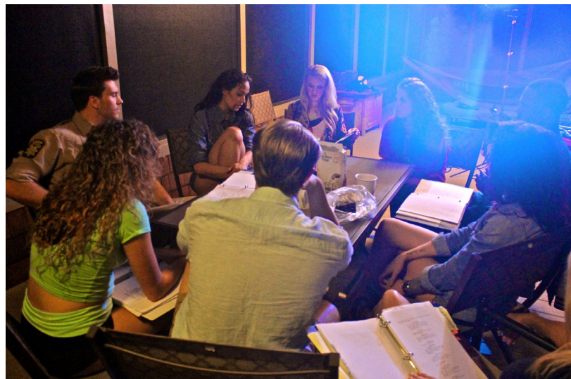
Cast running lines and hanging out by the lake.